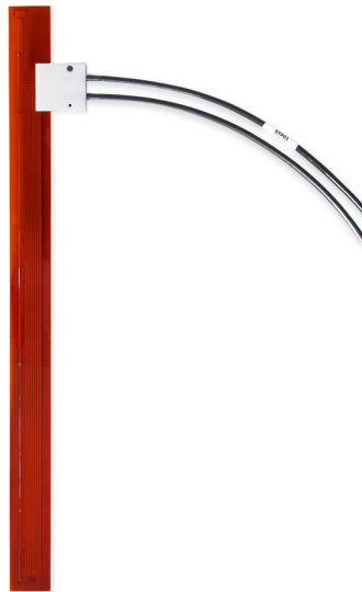
Figure 1 STP01 soil temperature profile sensor is applied in many large scale networks.

STP01 accurately measures the temperature profile of the soil at 5 depths close to its surface. It is used for scientific grade surface energy balance measurements. The sensor is buried and usually cannot be taken to the laboratory for calibration. The on-line self-test using the incorporated heating wire offers a solution to verify STP01's measurement stability.