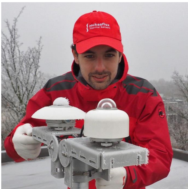
Figure 2 frost and dew deposition: clear difference between a non-heated pyranometer (back) and SR30 with RVH™ technology (front)