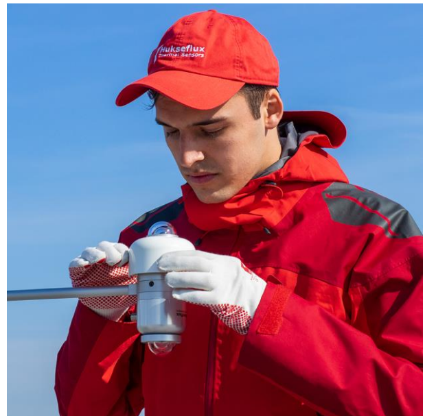
Figure 5 using SRA30 albedometer is easy; the instrument is composed of AMF03 and two SR30-D1 pyranometers