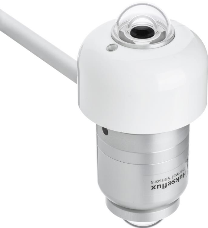
Figure 1 SRA30-D1 albedometer

SRA30-D1 Digital Spectrally Flat Class A albedometer is an instrument that measures global and reflected solar radiation and the solar albedo, or solar reflectance. SRA30-D1 is the most accurate albedometer available and heated for the best data availability. It is composed of one AMF03 albedometer mounting kit and two SR30-D1 Spectrally Flat Class A pyranometers. This pyranometer is compliant in its standard configuration with the requirements for Class A PV monitoring systems of the IEC 61724-1:2017 standard. Each pyranometer has a thermopile sensor, the upfacing one measuring global solar radiation, the downfacing one measuring reflected solar radiation. AMF03 includes one glare screen, one mounting fixture with rod, mounting hardware and tools. SRA30 complies with the latest ISO and WMO standards. The modular design facilitates maintenance and calibration.