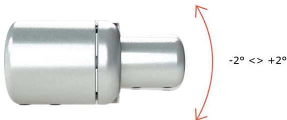
Figure 3 ALF01 albedometer levelling tool

ALF01 is a levelling tool that can be used with AMF03 to easily level the instrument. The ALF01 is mounted on a 1 inch outer diameter crossarm, and can be rotated around the tube axis for 360 ° as well as tilted over ± 2 °.