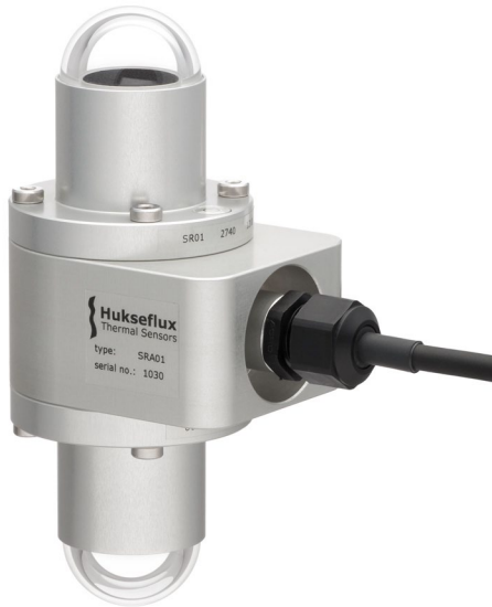
Figure 3 SRA01 second class albedometer, designed to fit a ¾ inch NPS mounting tube

SRA01 consists of two identical pyranometers model SR01, one facing up, one facing down. The albedometer body is designed to fit a ¾ inch NPS tube for mounting purposes. The cable can be led away through the tube (the tube's recommended outer diameter is < 28 \times 10^{-3} m, the inner diameter > 20 \times 10^{-3} m). Such a mounting tube is not part of the delivery. SRA01 can be ordered with longer cable and optional sun screens.