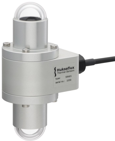
Figure 1 SRA01 second class albedometer

SRA01 albedometer is an instrument that measures global and reflected solar radiation and the solar albedo, or solar reflectance. It is composed of two identical second class pyranometers with thermopile sensors, the upfacing one measuring global solar radiation, the downfacing one measuring reflected solar radiation. SRA01 complies with the latest ISO and WMO standards.