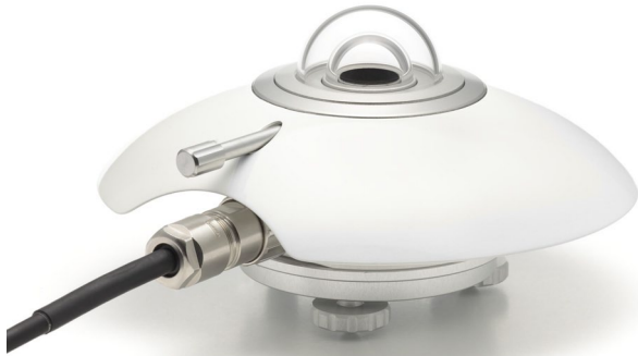
Figure 5 SR20 side view