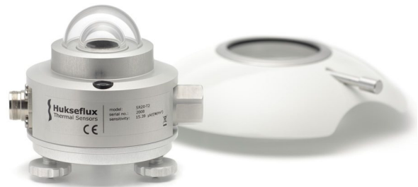
Figure 4 SR20 with its sun screen removed

The uncertainty of a measurement under outdoor conditions depends on many factors. Guidelines for uncertainty evaluation according to the "Guide to Expression of Uncertainty in Measurement" (GUM) can be found in our manuals. We provide spreadsheets to assist in the process of uncertainty evaluation of your measurement.