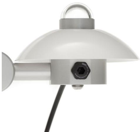
Figure 4 RA01 2-component radiometer in detail: pyranometer model SR01

Applicable instrument-classification standards are ISO 9060 and WMO-No.-8; Guide to Meteorological Instruments and Methods of Observation.