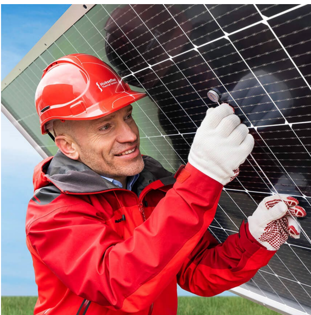
Figure 1 PVMT01 installed on the rear side of a PV module. The sensors are preferably installed at the centre of a cell close to the centre of the module. IEC requires 3 sensors per monitoring station.

PVMT01 is a back-of-module temperature sensor. PVMT01 is used to estimate and correct the performance index for the temperature dependence of module efficiency. The sensor meets the requirements of the highest-class systems for PV monitoring: IEC 61724-1 Class A. IEC suggests 3 such sensors per monitoring station, and requires that 6 or more sensors are used on a PV system, depending on the size of the system. PVMT01 includes a Pt1000 in a small aluminium disk, and a thin and flexible 1 m cable with connector. The cable can be easily extended by the user.