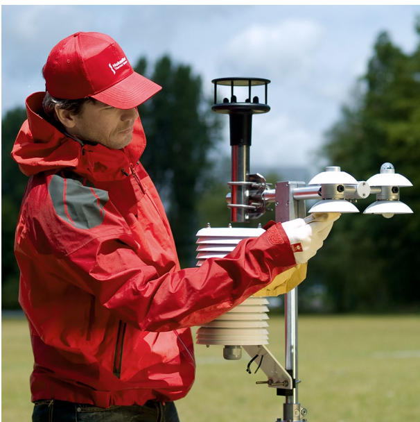
Figure 2 NR01 in use in a typical meteorological station