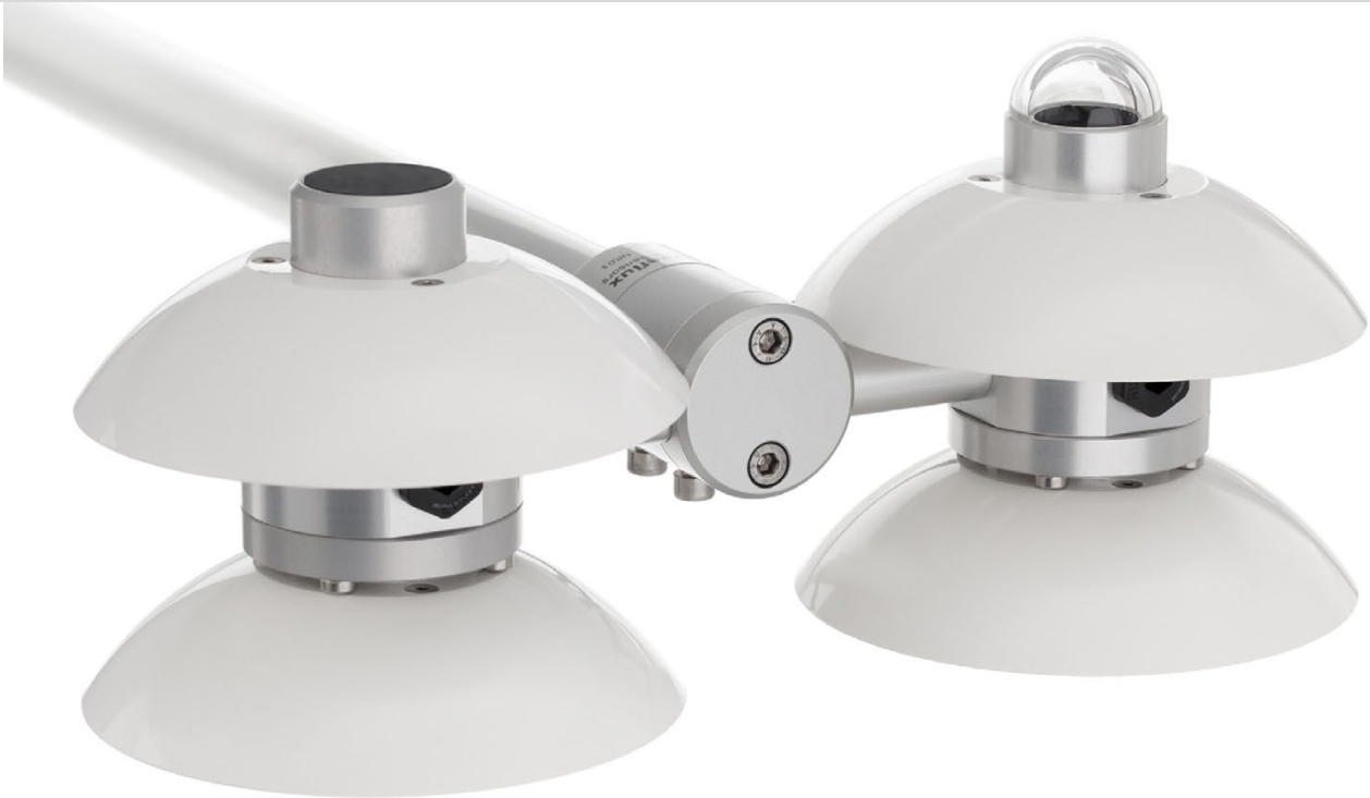
Figure 1 NR01 4-component net radiometer

NR01 is a market leading 4-component net radiation sensor, mostly used in scientific-grade energy balance and surface flux studies. It offers 4 separate measurements of global and reflected solar and downwelling and upwelling longwave radiation, using 2 sensors facing up and 2 facing down. NR01 owes its popularity to its excellent price / performance ratio. Advantages include its modular design with 2 pairs of identical sensors, low weight, ease of levelling, and low solar offsets in the longwave measurement. The unique capability to heat the pyrometers reduces measurement errors caused by dew deposition.