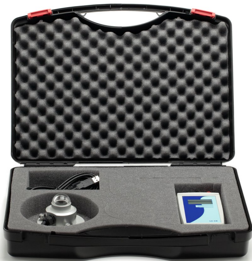
Figure 2 LP02-LI19 as it is delivered, in a practical transport case