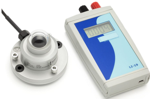
Figure 1 LP02 pyranometer with LI19 handheld read-out unit / datalogger

LP02 is a solar radiation sensor that is applied in most common solar radiation observations. LP02 complies with the second class specifications of the ISO 9060 standard and the WMO Guide. LI19 is a high accuracy handheld read-out unit / datalogger. The LP02-LI19 combination is well suited for mobile measurements and short term datalogging.