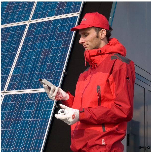
Figure 4 LP02-LI19 used in field measurement campaign