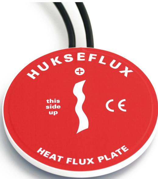
Figure 1 HFP01SC self-calibrating heat flux sensor. The opposite side has a blue coloured cover.

HFP01SC self-calibrating heat flux sensor™ is a heat flux sensor for use in the soil. It offers the best available accuracy and quality assurance of the measurement. The on-line self-test verifies the stable performance and good thermal contact of sensors that are buried and cannot be visually inspected and taken to the laboratory for recalibration. The self-test also includes self-calibration which compensates for measurement errors caused by the thermal conductivity of the surrounding soil (which varies with soil moisture content), for sensor non-stability and for temperature dependence.