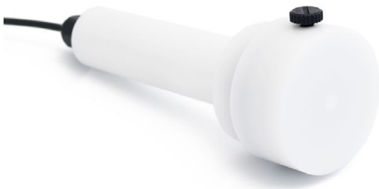
Figure 4 HF03 with its protection cap