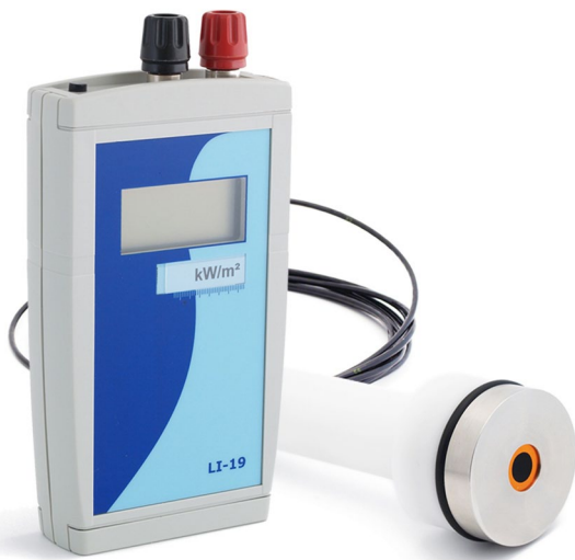
Figure 1 HF03-LI19 portable heat flux sensor with read-out unit / datalogger

HF03 is a heat flux sensor that is applied in mobile measurements. It is combined with LI19, a high accuracy handheld read-out unit / datalogger. The combination HF03- LI19 is typically used to study heat flux levels of flares and fires, and to verify the performance of permanently installed flare radiation monitors and flare heat flux sensors.