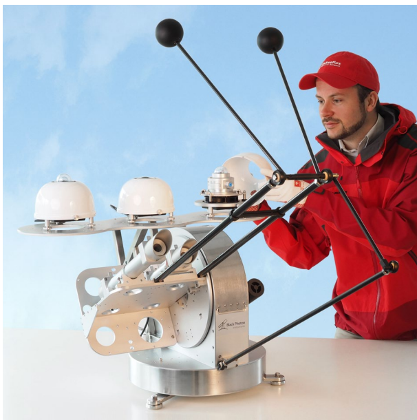
Figure 2 pyrheliometers and pyranometers on a tracker