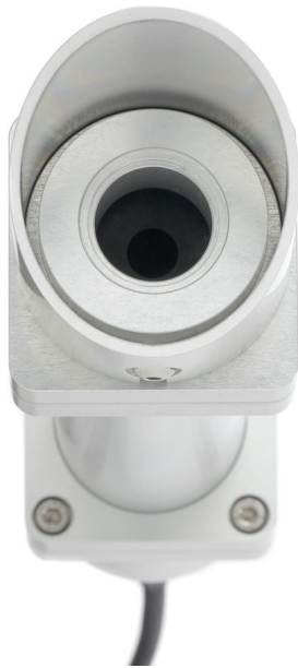
Figure 1 DR02 fast response first class pyrheliometer showing its polished quartz window assembly with heater

DR02 is a high accuracy direct (normal incidence) solar radiation sensor with a short response time. The scientific name of this instrument is pyrheliometer. DR02 complies with the first class specifications of the ISO 9060 standard and the WMO Guide. Its fast response makes it very suitable for PV (photovoltaics)-related applications. DR02 pyrheliometer has a heated window and is used in tracker-mounted operation.