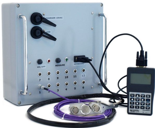
Figure 1 the ALUSYS measuring system, for trend - monitoring and comparative surveys of heat flux and surface temperature in industrial environments. Connected to the MCU: one HF01 sensor, as well as the Keyboard Display.

ALUSYS is a measuring system for trend-monitoring and mobile survey of heat flux and surface temperature in industrial environments. Sensors and electronics have the robustness necessary for this application. Powered from a low-voltage rechargeable battery, it is easy and safe to use. In its standard configuration the system consists of an MCU Measurement Control Unit in a metal housing and 12 x heat flux and surface temperature sensors of model HF01. Measured data are stored for later analysis.