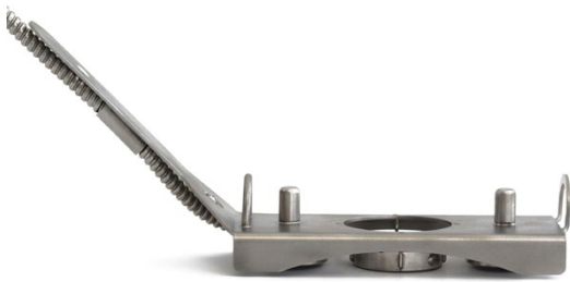
Figure 3 HF01 heat flux and surface temperature sensor with frame with magnets

HF01 heat flux sensor calibration is traceable to SI units. The factory calibration method follows the recommended practice of ASTM C1130. The recommended calibration interval of heat flux sensors is 2 years.